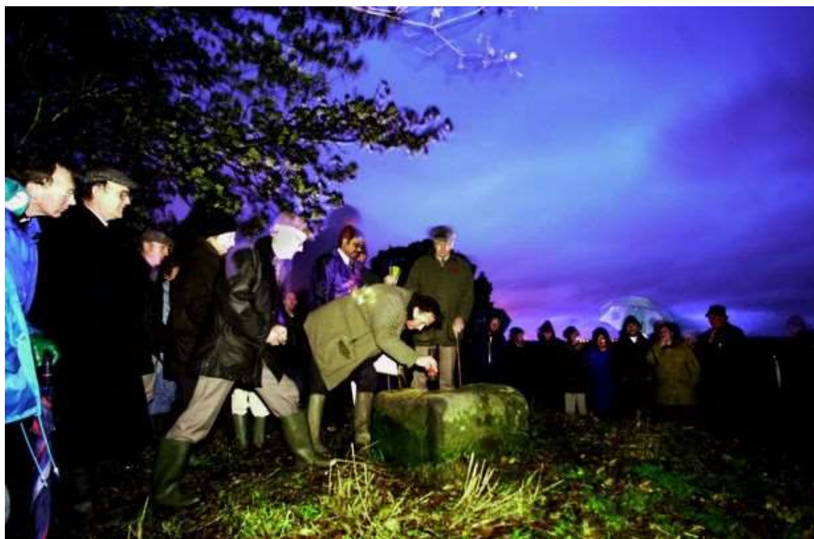
Wroth Silver ceremony at dawn